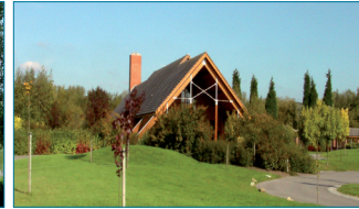
Howe Bridge, Atherton