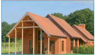
Wessex Vale, Eastleigh

Operates twenty four crematoria and a number of cemeteries across England, Scotland and Wales, many in partnership with local authorities. Westerleigh has particular experience of developing new crematoria, having built sixteen in the last two decades – all on greenfield sites in pleasant rural locations. Our new proposed crematorium will offer state of the art facilities within a green parkland landscape. The focus is on providing a facility where the bereaved leave with memories of green space, flowers and trees. Below are typical examples of crematoria we have built elsewhere: