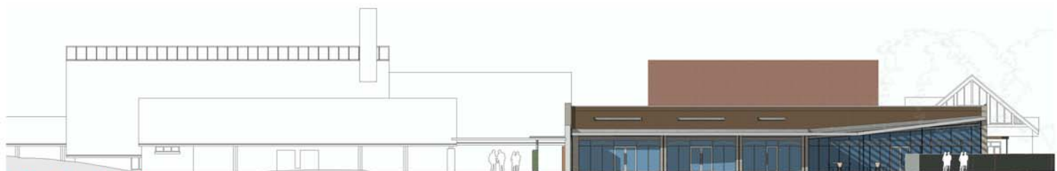
Elevation: View B