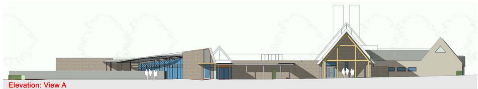
Elevation: View A