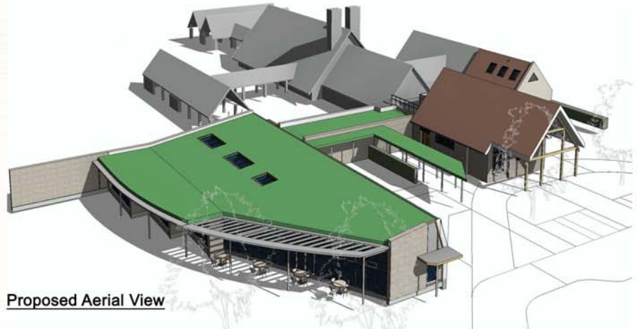
Proposed Aerial View