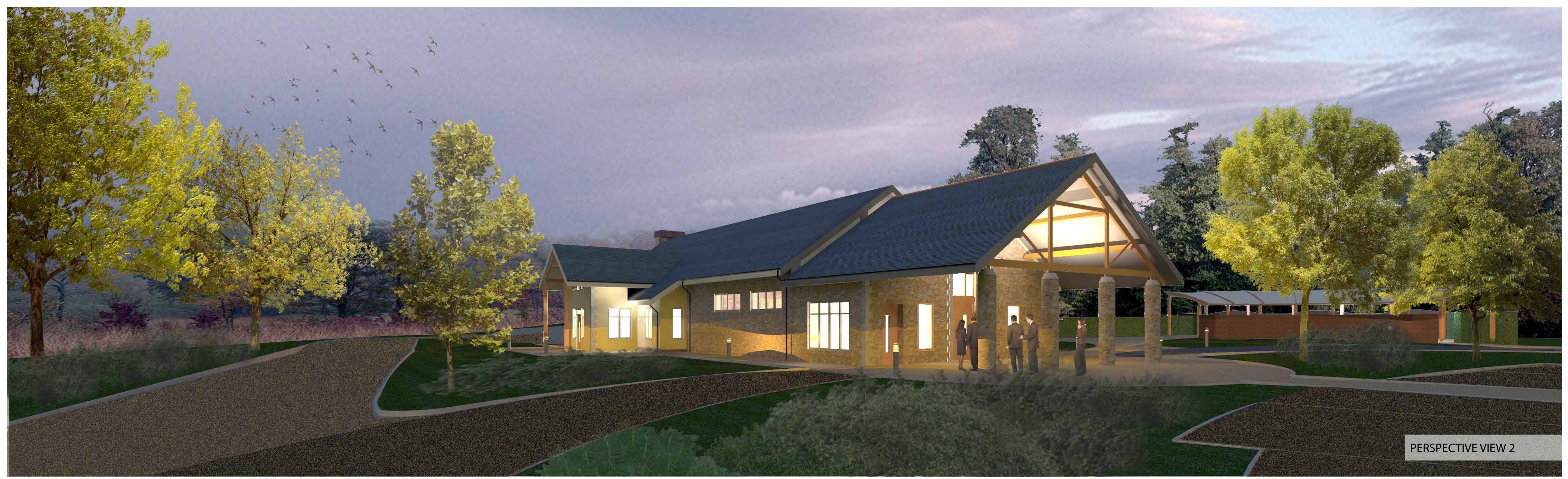
PERSPECTIVE VIEW 2