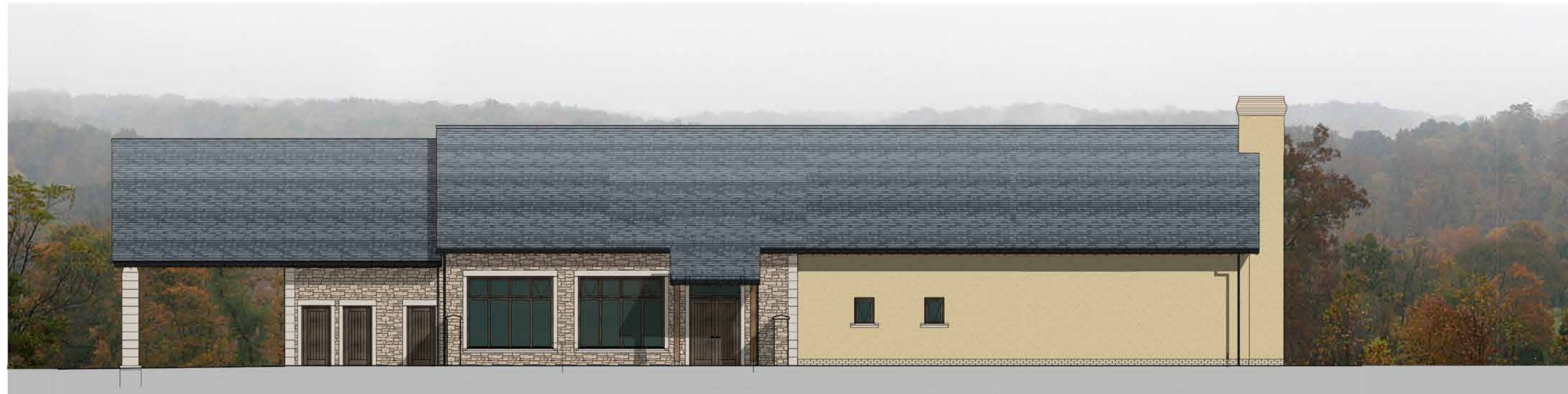
West Elevation 1 : 100