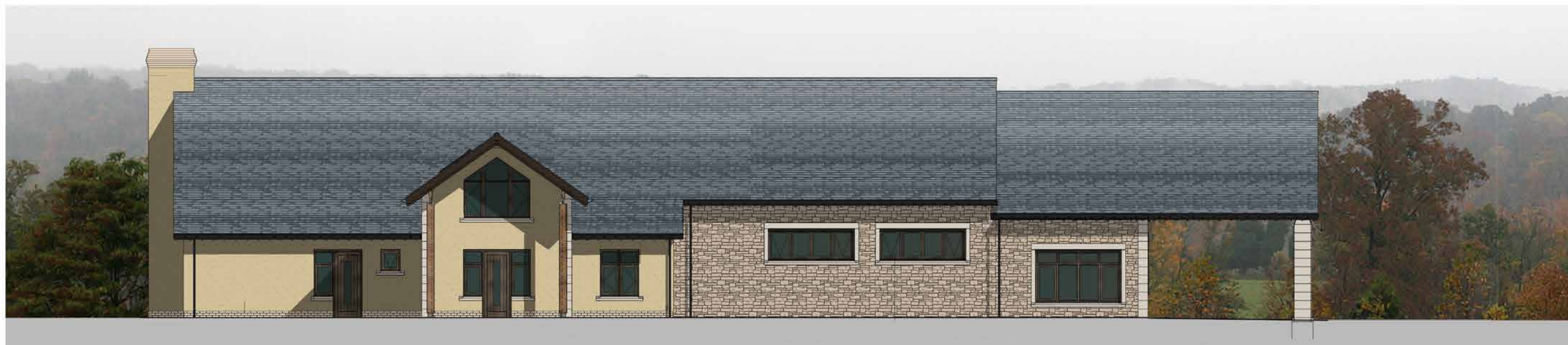
East Elevation 1 : 100