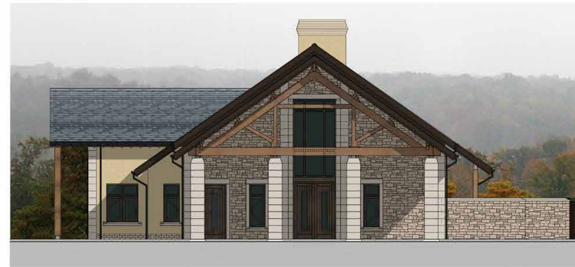
North Elevation 1 : 100