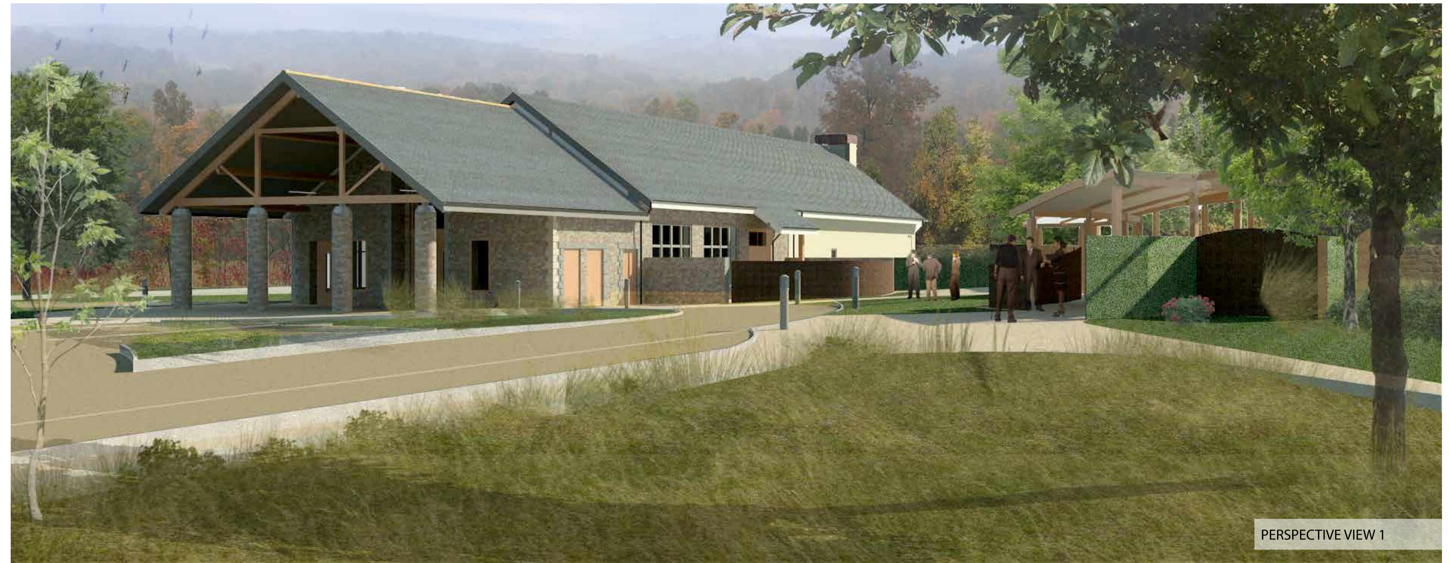
PERSPECTIVE VIEW 1