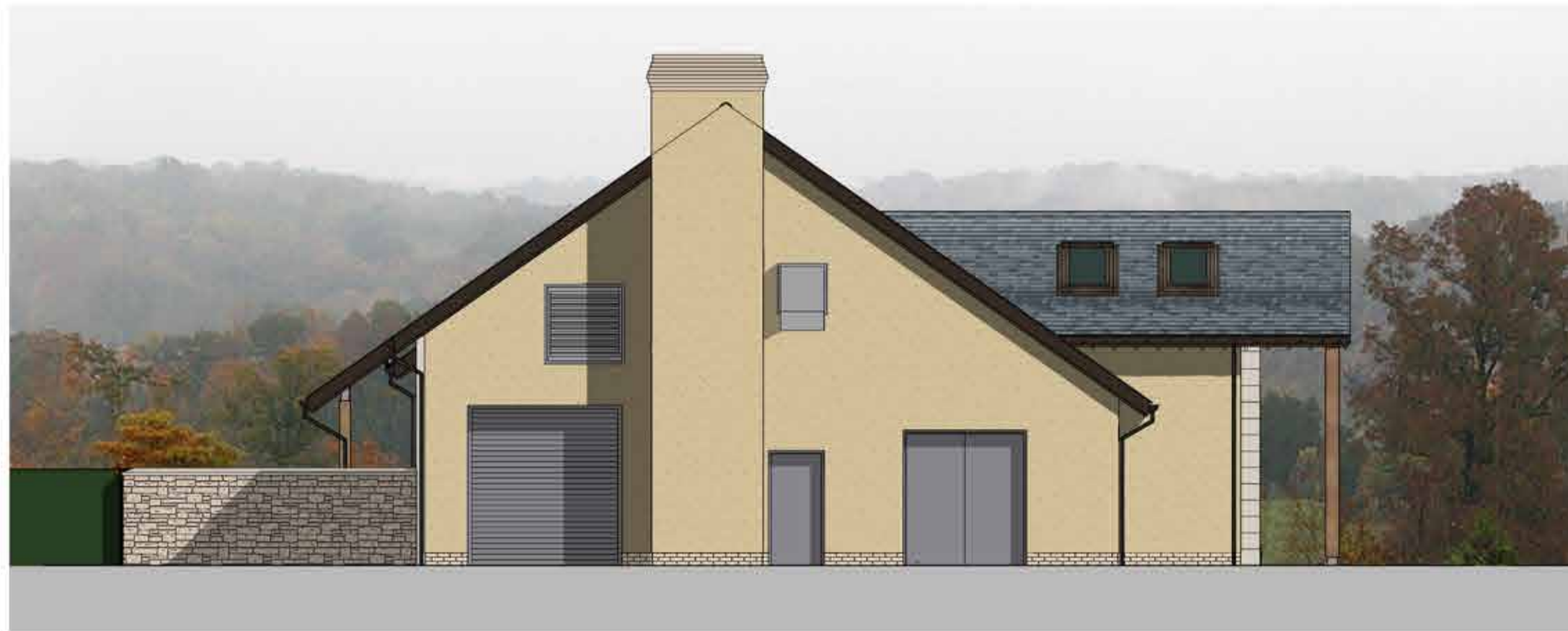
South Elevation 1 : 100