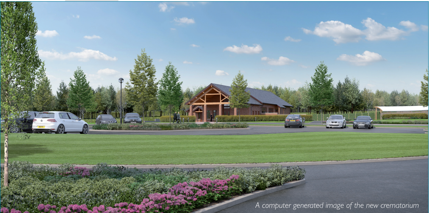
A computer generated image of the new crematorium

The three crematoria are operating above capacity. This leads to long delays, of over 3 weeks at the busiest times of the year, even though the crematoria allow just 30 minutes for a funeral service. A new crematorium would greatly relieve this pressure as well as providing a much more accessible option for families to the East of Leeds.