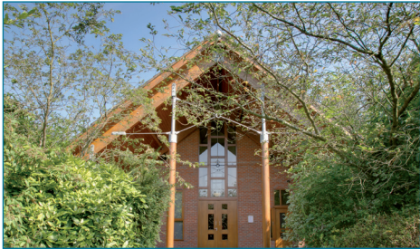
Howe Bridge Crematorium, Atherton