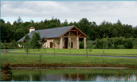
West Lothian Crematorium, Livingstone

The photographs below show typical examples of crematoria we have built elsewhere; you can find more on our website: http://www.westerleighgroup.co.uk/locations.php