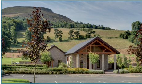
Borders Crematorium, Melrose