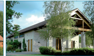
West Wiltshire, Trowbridge