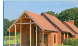
Wessex Vale, Eastleigh

Below are typical examples of the crematoria we have built elsewhere: