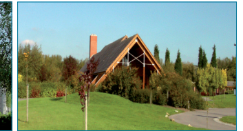
Howe Bridge, Atherton

The internal layout has been designed to cater for funerals of any faith or belief with an open, light chapel. Externally the grounds are landscaped to provide peaceful surroundings and memorial gardens. The external appearance of the building will be designed to respect the character and appearance of the surrounding area, whilst being in harmony with the countryside location.